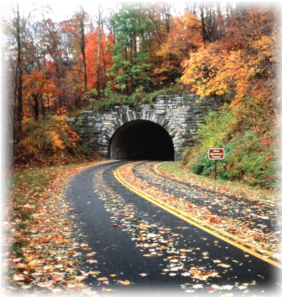
All Aboard - The Fall Express.... page 3