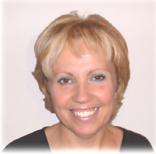
by Alexandra Edwards

One of America's most traditional holidays is Thanksgiving Day. A day where families and friends gather round the dining table and, before tucking into a feast of the traditional roast turkey, say grace giving thanks to God for a good bounty of crops and the many blessings received.