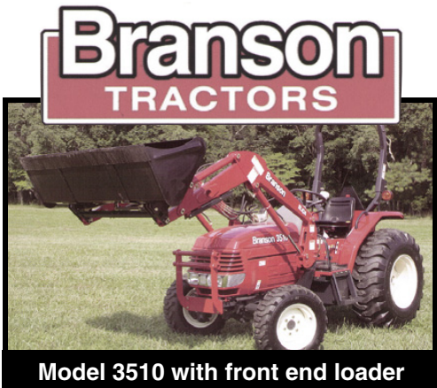
Model 3510 with front end loader