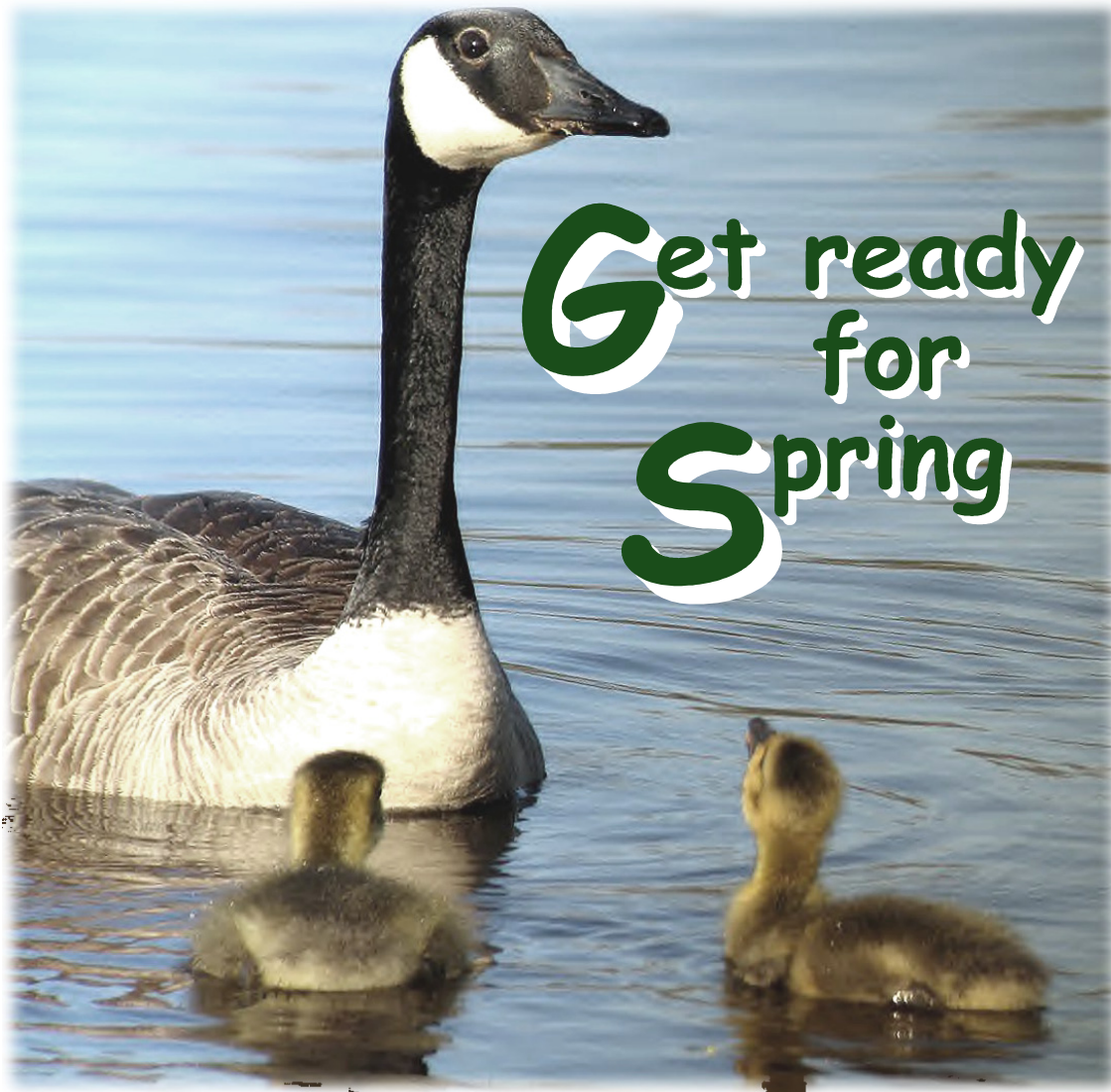
Gem Hunting.... page 3

The concept of "fingerprinting bullets" is not new. In fact a recommendation came in 1935 during hearings on proposed handgun legislation in the US Senate. A man named Hector Pocaroba suggested placing serial numbers inscribed upon small metal tape inside every bullet manufactured in the United States. The idea back then, was the same as now; to identify the person firing a crime bullet. Unlike ballistic fingerprinting, ACS technology doesn't require any special training or equipment for law enforcement to use other than very good eyesight or a really good magnifying glass.