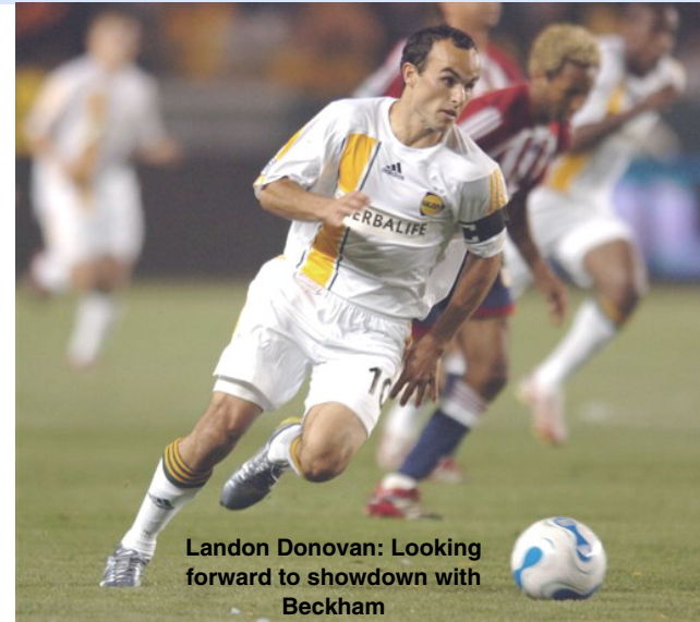
Landon Donovan: Looking forward to showdown with Beckham

In the next couple of weeks, expectations will be made. Deals will be made by players with their monotheistic or polytheistic higher power(s). Lives will be changed forever. If a certain player reaches down and performs seven games with a passion, which only comes along once in a lifetime, he will be a hero in his native land the rest of his days.