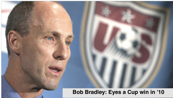
Bob Bradley: Eyes a Cup win in '10