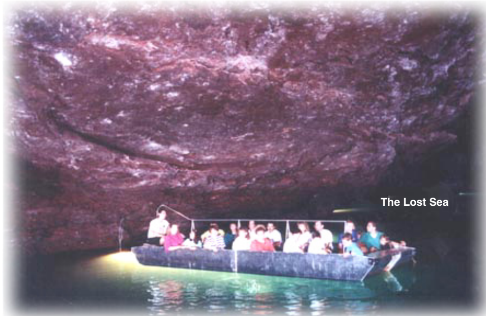
The Lost Sea