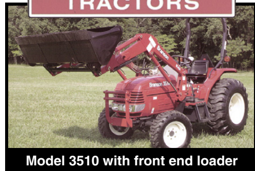
Model 3510 with front end loader

Serving East Tennessee & North East Georgia