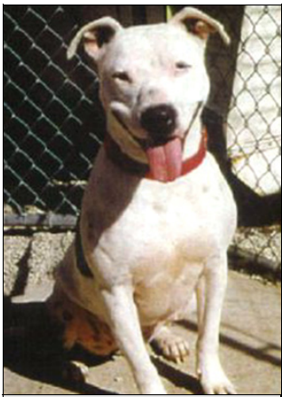
A "sweet and caring" Pit Bull

Almost weekly, there is a story on the news about a savage pit bull attack somewhere in our country. Authorities regard pit bulls as the most vicious breed of dogs, and a lot of insurance companies will not issue homeowners policy if there is a pit bull on the premises.