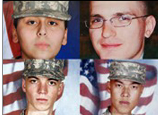
Four of the "sweet and caring" Muslim's victims

cause. The Army knew Major Hasan did not want to go over to the Middle East and be a part of the fight against his faith. The Army thought he was their kind, loving pit bull - oops, I mean Muslim. The two are very easily confused, aren't they?