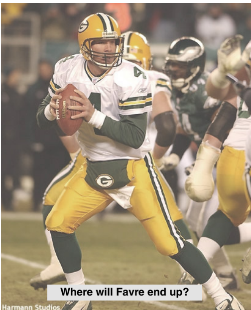
Where will Favre end up?

At the time of print, Favre did not report to training camp but was asked not to by the Pack-