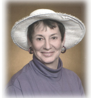
by B J Armstrong

attitude along with a positive belief system. Only you have the ability and power to the way you think and believe. The choice is yours... in doing so, you are open to changing your life.