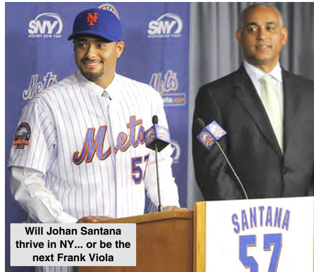
Will Johan Santana thrive in NY... or be the next Frank Viola