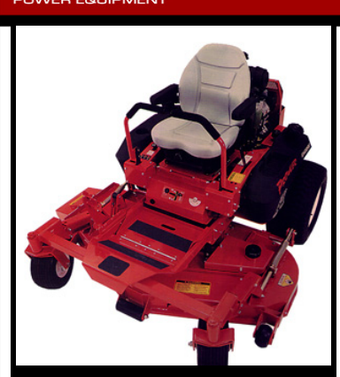
Serious RED Mowing Machines